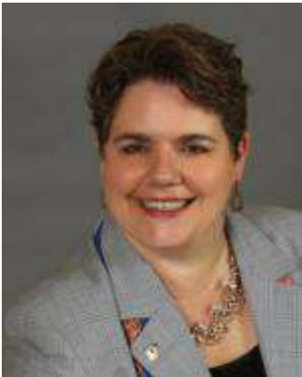
District Governor Tia Saletta Oakdale