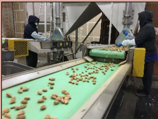
Workers sort almonds at Crown Nut Company in Tracy.