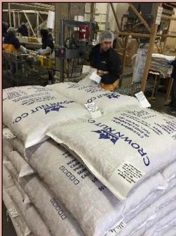
Workers bag almonds for shipment at Crown Nut Co. in Tracy, the site of a recent vocational tour.