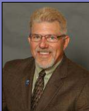
Area 2 Ray Call North Stockton