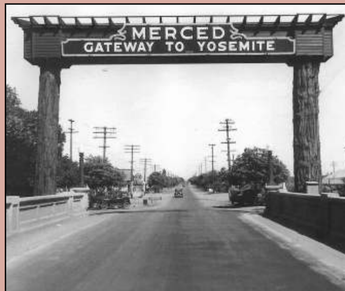
Welcome Sign over 16th street in the 1920s