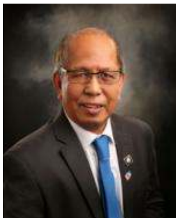
District Governor - Elect Ray Caparros Escalon Sunrise